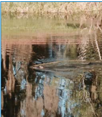
This guy wanted to join in the petting zoo too.

We recently installed a security camera at the farm in Plant City. Check out what we caught on camera!