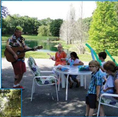
Silly Sam put on a great show