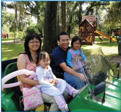
The Wong Family enjoys a ride on the Gator tractor