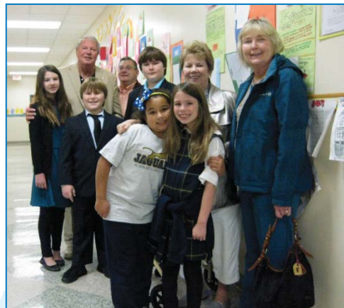
Grandparents & Grandkids