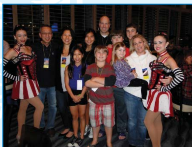
BFF was the "Big Top" Sponsor again this year