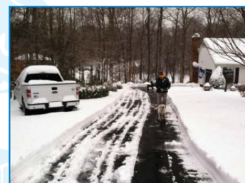
Stan taking Gracie for a walk