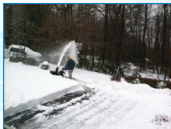
That's A LOT of snow!