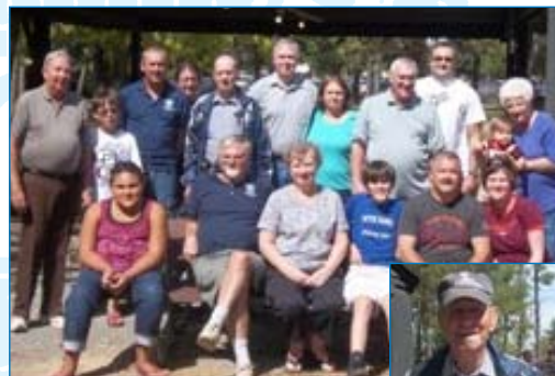
Attendees of the Winchester Family Reunion

The annual reunion took place in September. Everyone enjoyed catching up and had a great time.