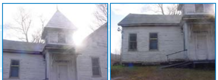
Beartown School before paint and repair work