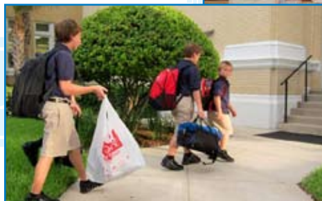
Away they go