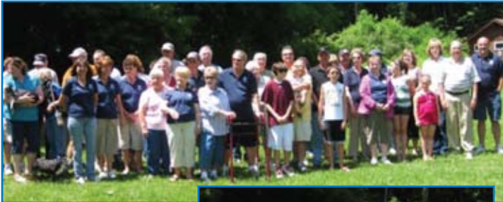
We are family!

The annual family reunion takes place on Memorial Day Weekend at Camp Creek State Park in West Virginia